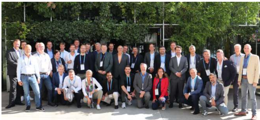
52nd EPSM Meeting in Zurich - 28 September 2023

To become a member, an endorsement by two EPSM members is necessary.